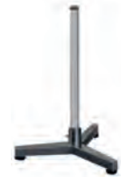
Steel painted column