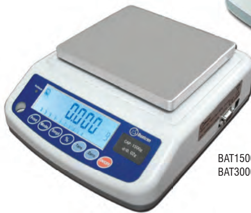
BAT1500 - 260113 BAT3000 - 260115