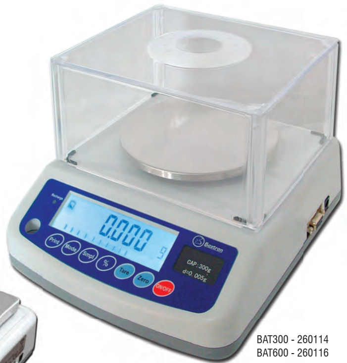
BAT300 - 260114 BAT600 - 260116