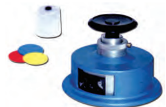
Cutter for samples